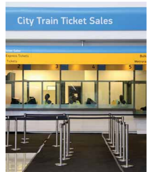
Cape Town Station

With several new stadiums constructed around the country, PRASA's property subsidiary Intersite has built impressive stations to match at Moses Mabhida (R140 mil) and Century City (R59 mil). A further R100 million has been spent on integrating the existing Rhodesfield Station adjacent to OR Tambo International Airport with the Gautrain Rhodesfield Station.